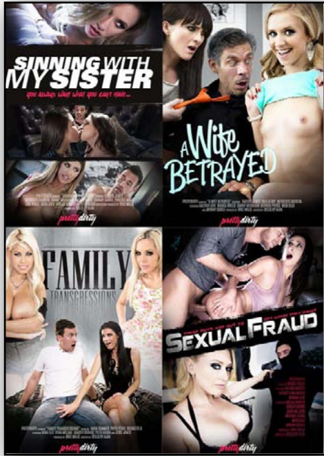
A Wife Betrayed Family Transgressions Sexual Fraud Sinning With My Sister