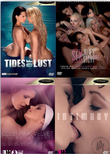
Viv Thomas 4-Pack #4 Club Pink Velvet 2 Intimacy Lesbian Sex Diaries: Julie's Story Tides Of Lust