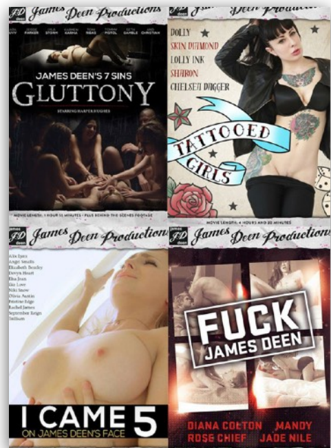
James Dean 4-Pack #5 Fuck James Deen Gluttony I Came On James Deen's Face 5 Tattooed Girls